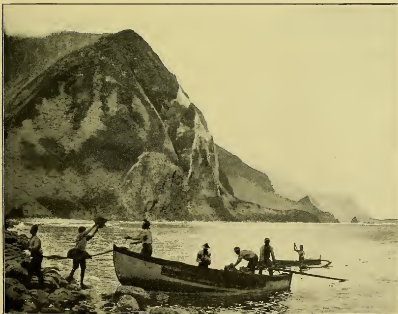
B. NORTH COAST OF MOLOKAI, LOOKING WEST FROM THE LANDING AT WAILAU.

Showing parts of surface of volcanic cone, deeply dissected by gulches, débris fans at mouth of gulches, and coral reef below shallow water near shore.